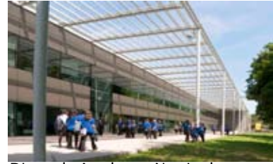
Djanogly Academy, Nottingham