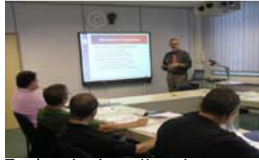
Tresham Institute, Kettering