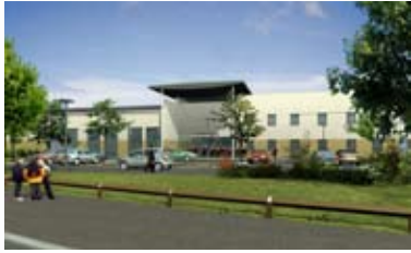
St Joseph's School, Swindon